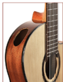
monitor sound hole

solid spruce top, sapele back & sides, rosewood fingerboard, Fishman Sonitone electronics